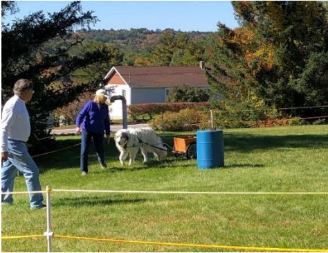
360 Left Turn