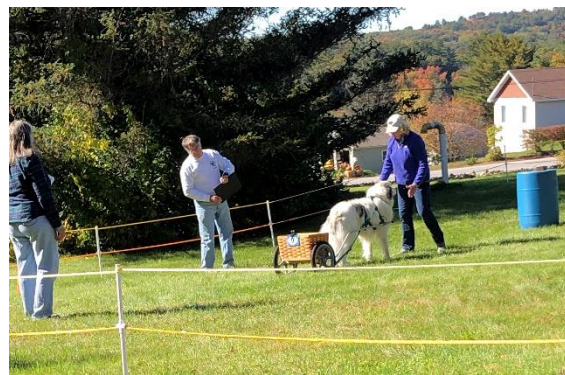
Three Foot Back Up in One Minute