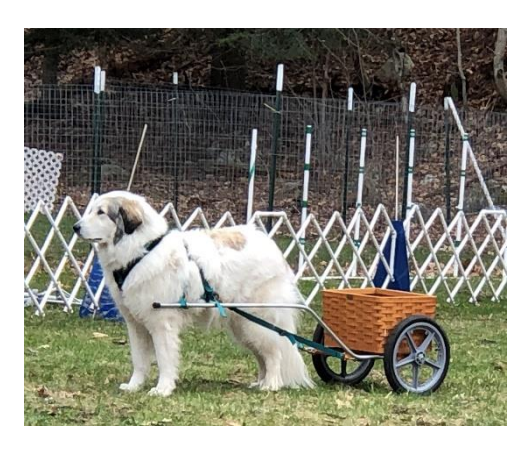
3 minute Out of Sight Stay at Draft Test