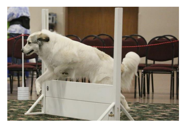
Nat'l Specialty Rally Trial - Master Class