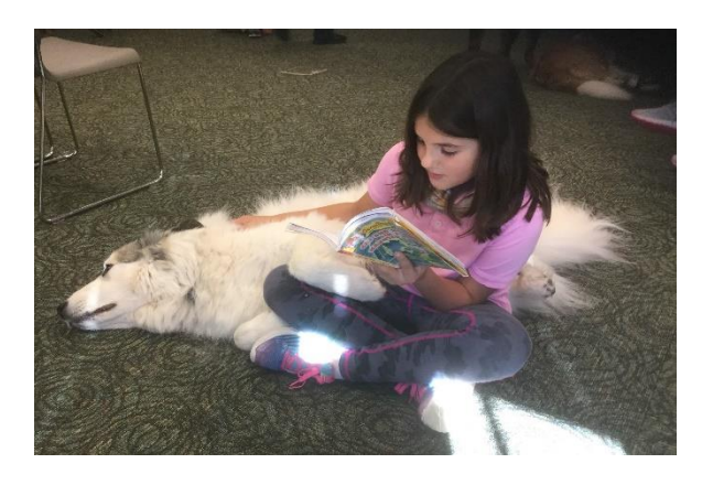
Read aloud to a dog visit at a library