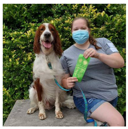
Dexter with his first 2 RN Legs

My advice for new handlers is: join the club, take the classes, listen and learn from the instructors and other participants! I can't imagine how much further along I'd be if I had joined the club sooner. The classes really do make a difference. It's been difficult balancing training, competing, and working in a hospital. Being able to "do it all" isn't something that always goes perfectly, but I keep trying.