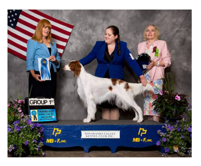
Fallon National BISS