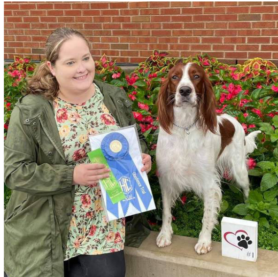
BEGINNER NOVICE TITLE