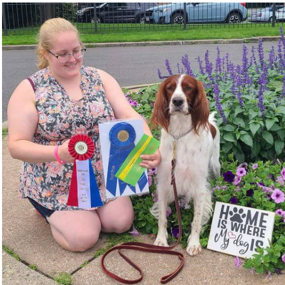
RALLY INTERMEDIATE TITLE

P!nk got her last 2 legs in Rally Intermediate with a 95/3rd place and 97/1st place to finish her title! She also got her last Beginner Novice leg with a 191 to finish that title as well. She then followed that up with her first Novice leg and a score of 188!