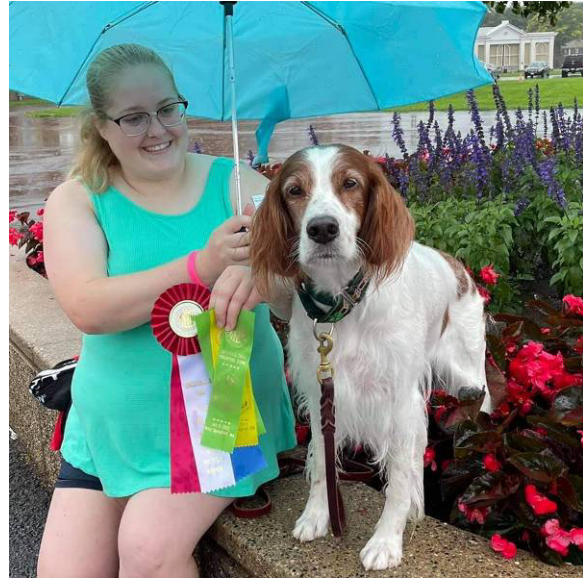
RALLY EXCELLENT TITLE

P!nk got her last 2 legs in Rally Intermediate with a 95/3rd place and 97/1st place to finish her title! She also got her last Beginner Novice leg with a 191 to finish that title as well. She then followed that up with her first Novice leg and a score of 188!