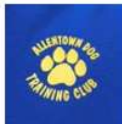
ADTC w/paw logo at right